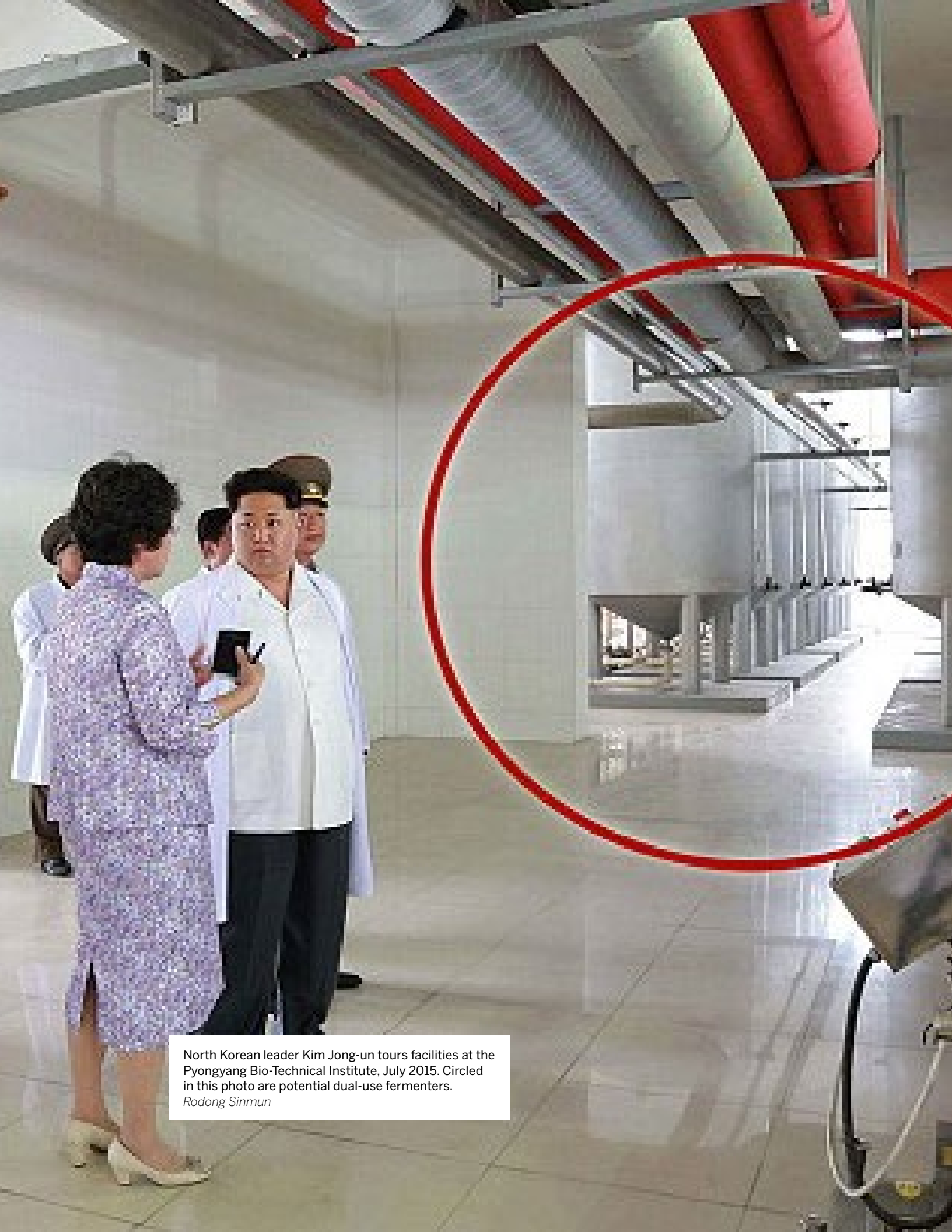
North Korean leader Kim Jong-un tours facilities at the Pyongyang Bio-Technical Institute, July 2015. Circled in this photo are potential dual-use fermenters.