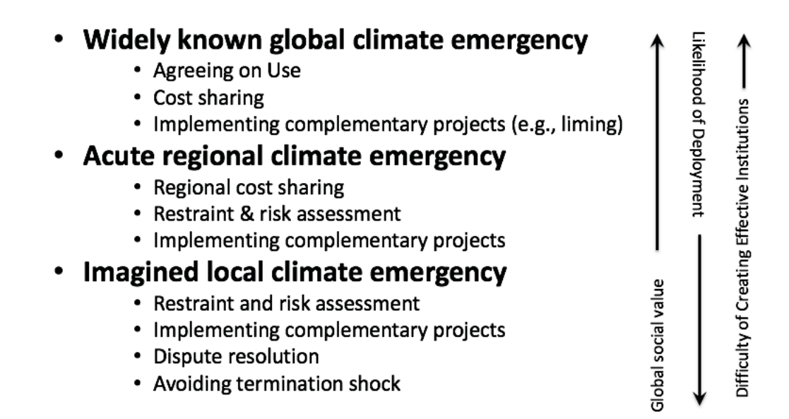
Figure 1: Stylized Deployment Scenarios for Solar Geoengineering

For too long, the discussion of geoengineering governance has involved too much imagination about governing institutions and not enough attention to the incentives for countries to build such institutions. A focus on incentives may suggest that it will be impossible to gain truly global support for institutions that can effectively restrain unilateral geoengineering. But it also suggests that there could be very powerful incentives for countries to create something different: a club that prepares responses to unilateral geoengineering. An ideal world institution for global governance of geoengineering may be tempting to envision, but this outcome is unlikely. A "blade runner" world of countries working together to counter rogue geoengineers presents a darker picture, but is perhaps more probable and therefore a more useful basis for practical discussions of governance.