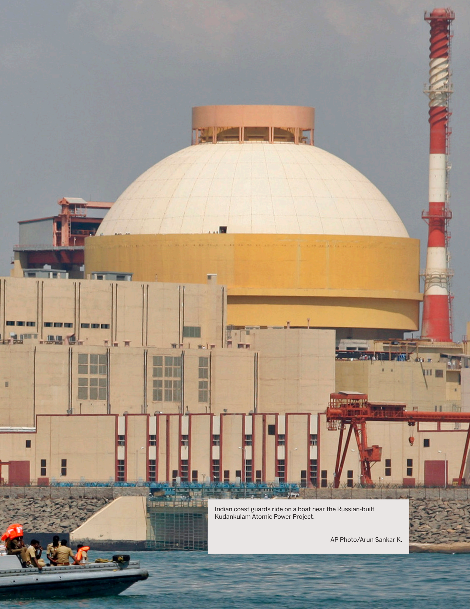
Indian coast guards ride on a boat near the Russian-built Kudankulam Atomic Power Project.